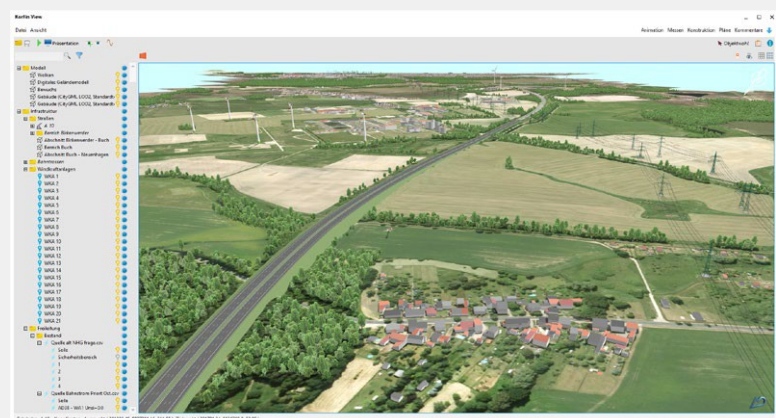
KorFin® View overhead powerlines and power plants in large environment models