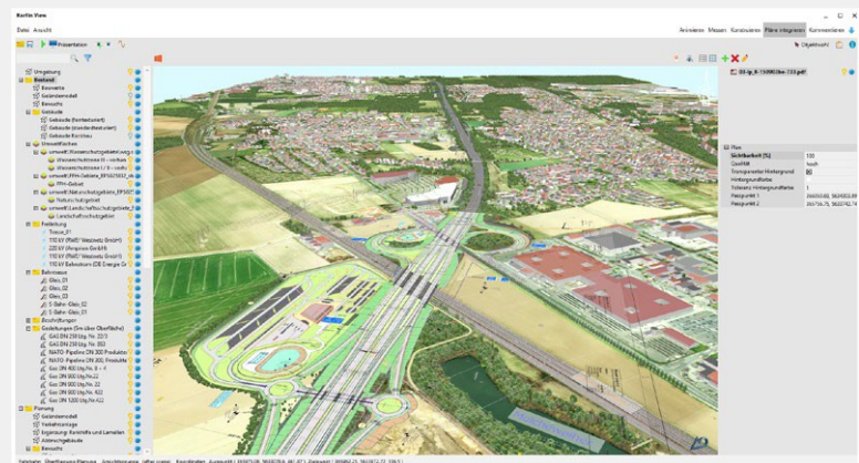
KorFin® View road with plan overlay

Adjust the real shadow cast after entering location and time, or create movies of the overall model in external renderers.